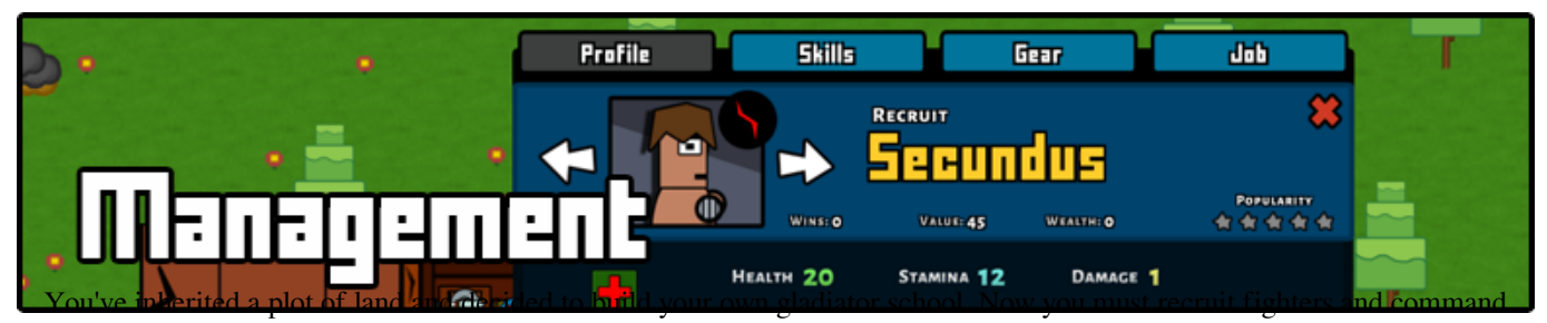
them to train hard. Every decision will matter.

Gladiator School is a deep management simulation game with hand drawn, humorous characters and environments.