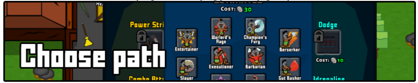
Your goal is clear, make your gladiators famous in the arena to earn as much coin as possible. Make the crowd go wild...