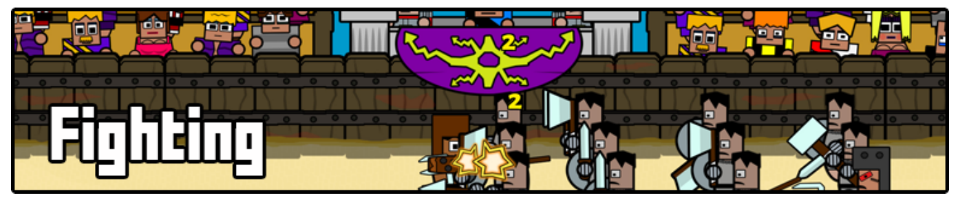
Keep a close eye on your gladiators, make sure they are well fed, loyal and that they get some recreational time outside the gym or they might become very angry and rise up against you.